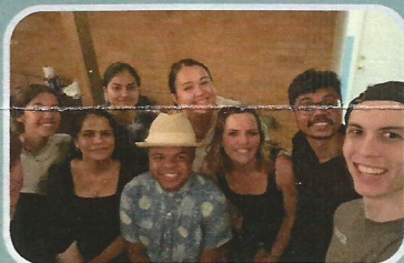
House Party Fun